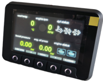
CANVIEW 4 Display