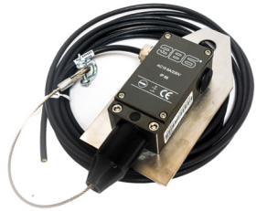
ANTI TWOBLOCK/Limit switch with plate