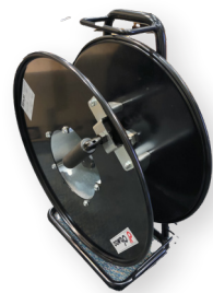
Manual Cable Reel