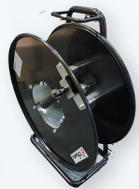
Manual Cable Reel