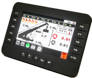
TERA 7 Display