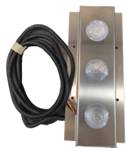
Three-element signalling light system (green/yellow/red)