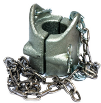
Weight for limit switch